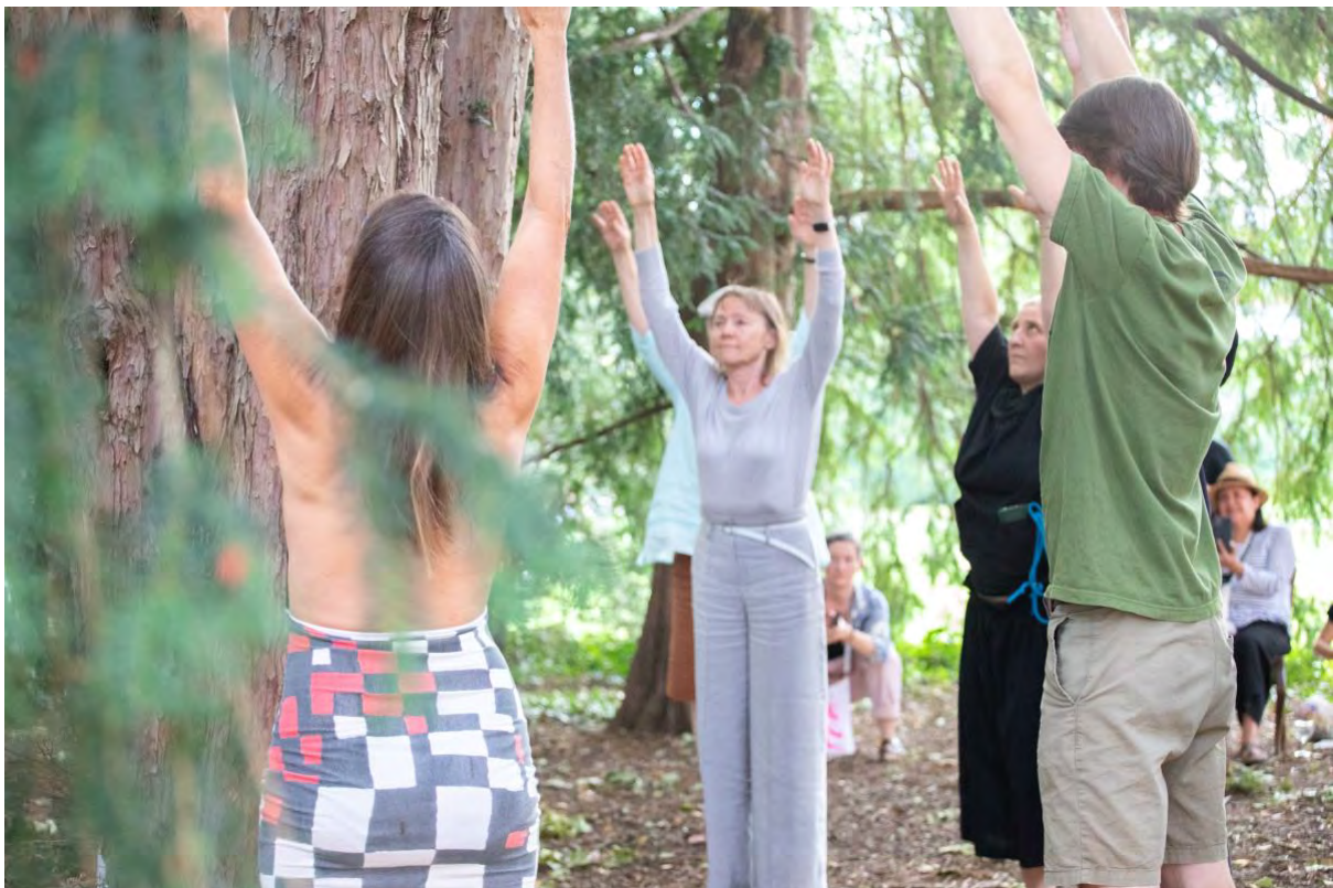
Pondering in the Park (performance 23.7.2022, Museum Tinguely, Basel) https://www.researchcatalogue.net/view/1323410/1709845