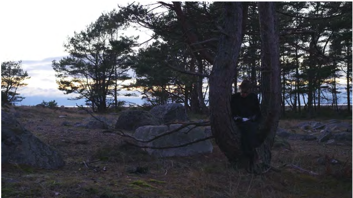
Kära Tall (Another day with a pine – with text) (2020) 14 min. – video still.

https://www.researchcatalogue.net/profile/show-work?work=1073481