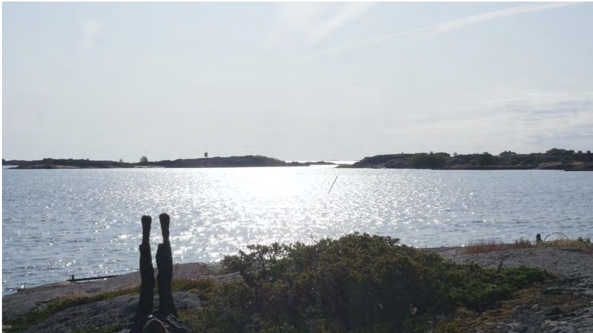
Day with a Juniper 1 (2019) 21 min 56 sec. – video still.

https://www.researchcatalogue.net/profile/show-work?work=635417