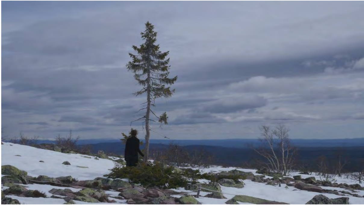
Day with Old Tjikko 1 (2019) 17 min. – video still.

https://www.researchcatalogue.net/profile/show-work?work=635417