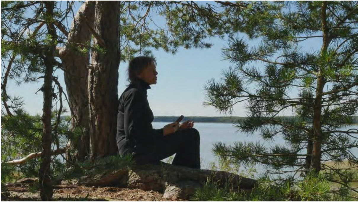
Silakkarin Männylle – To the Silakkari Pine 2 (2022) 15 min 5 sec – video still. https://www.researchcatalogue.net/view/1323410/1713324 (scroll down on the page)