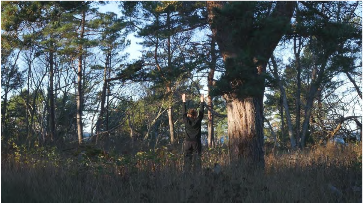
The Pine's Apprentice (2020) 53 min – video still.

https://www.researchcatalogue.net/profile/show-work?work=1073481