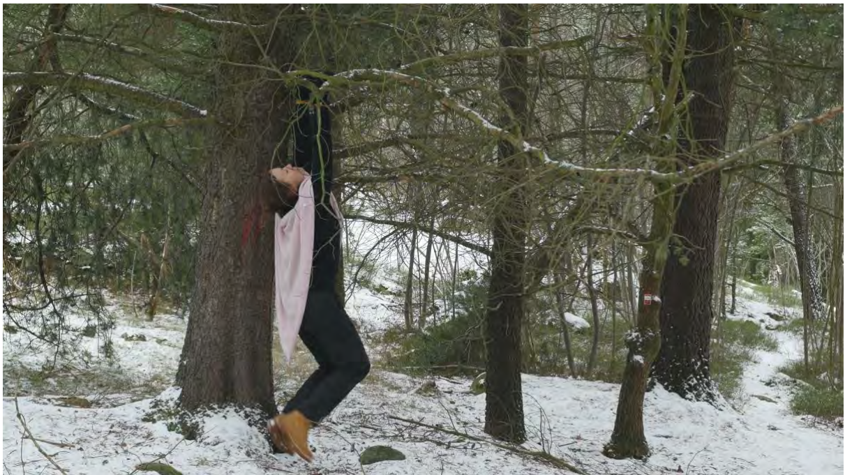
Hanging in a Pine (2019) 15 min 28 sec – video still. https://www.researchcatalogue.net/profile/show-work?work=592026