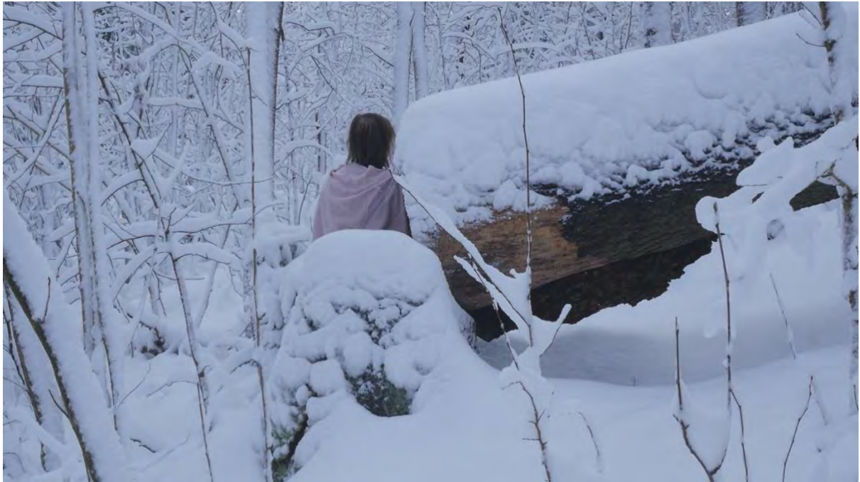
Year of the Dog in Lill-Jans' Wood (On a Spruce Stump) I (2019) 1h 40 min. 10 sec. – video still. https://www.researchcatalogue.net/profile/show-work?work=612191