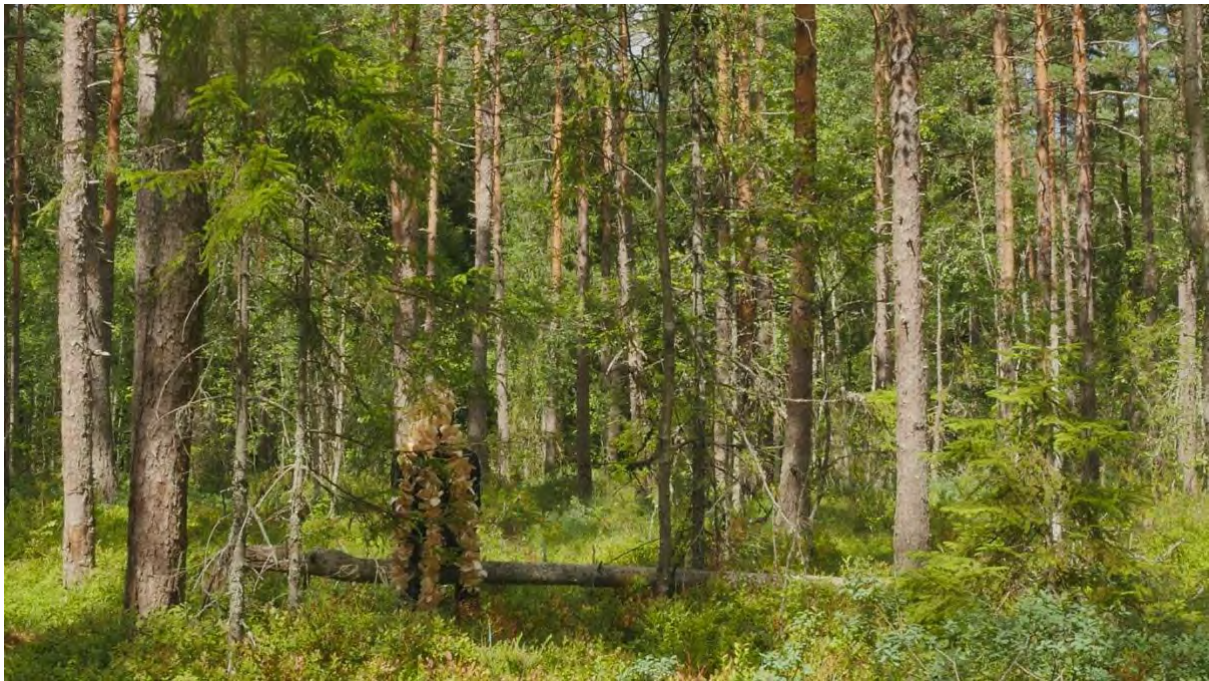
Dressed in Wood (2022) 4 min 5 sec – video still. https://www.researchcatalogue.net/view/1323410/1685771 (scroll down on the page)