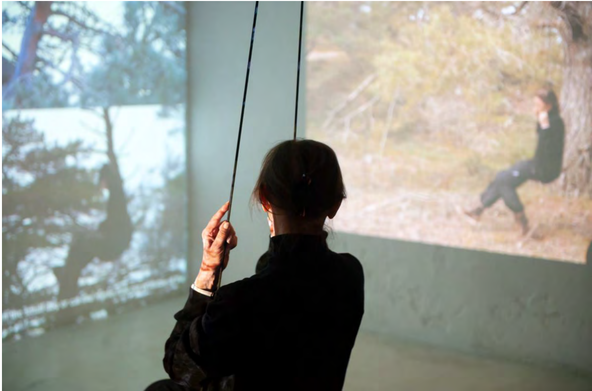
Practicing with Pines (performance 26.4.2022, Myymälä 2, Helsinki) https://www.researchcatalogue.net/view/1323410/1599519