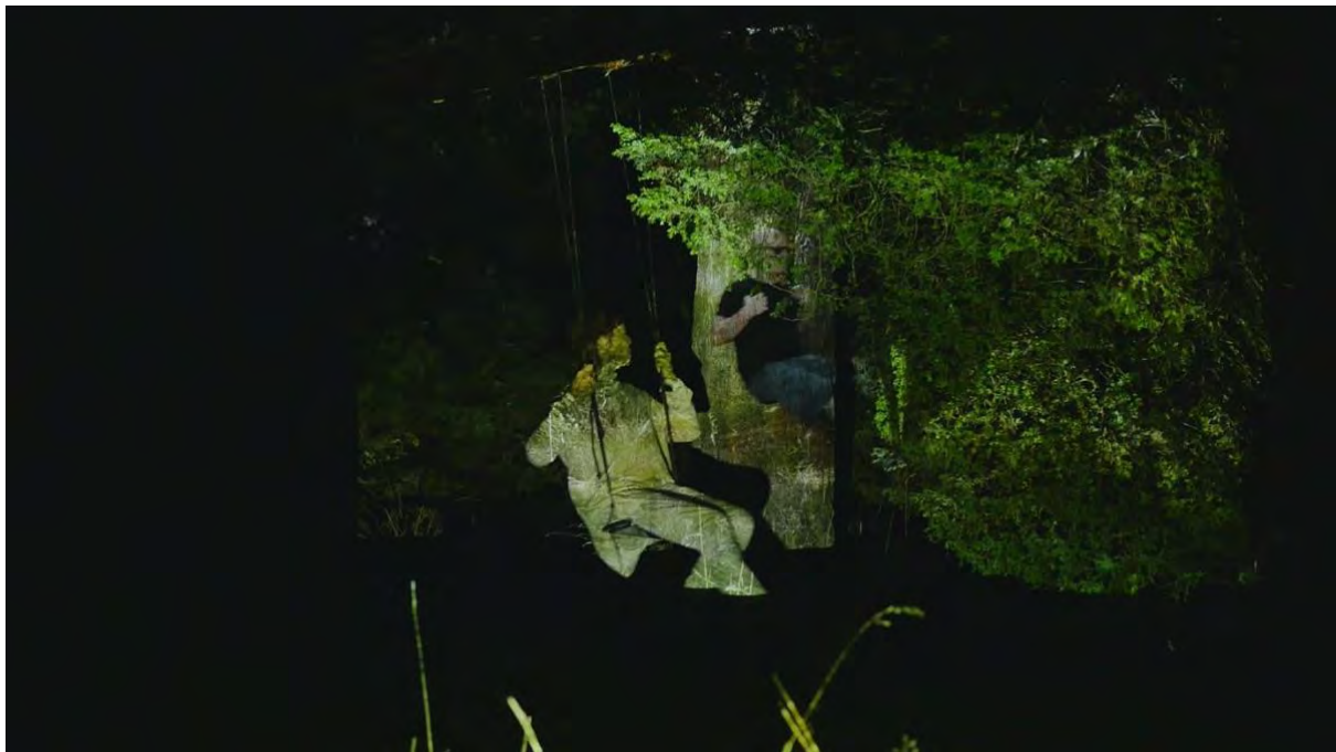
Swinging in a Pine (performance on Öro 2.9.2021) – video still.

https://www.researchcatalogue.net/view/761326/1165222/64/82